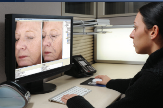
Technical QC of auto analysis.