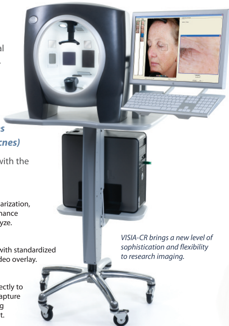
VISIA-CR brings a new level of sophistication and flexibility to research imaging.

Images captured with the VISIA-CR booth are saved directly to an electronic record in Canfield's Mirror software. The capture tool provides customizable shooting templates allowing multiple lighting modes to be captured in a single burst.